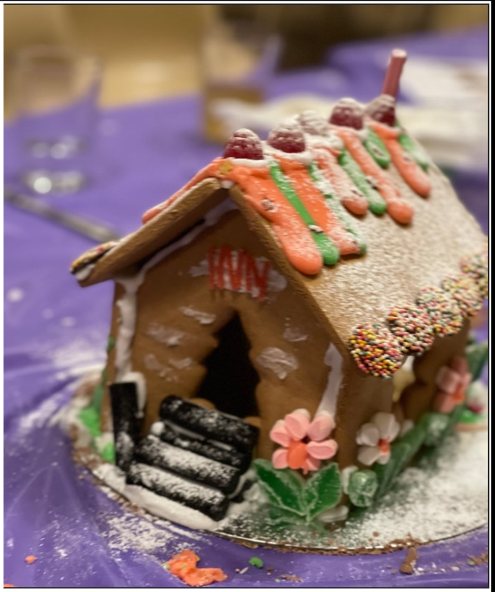
Beautiful and delicious Gingerbread Houses created at the Gingerbread House Decorating Night.