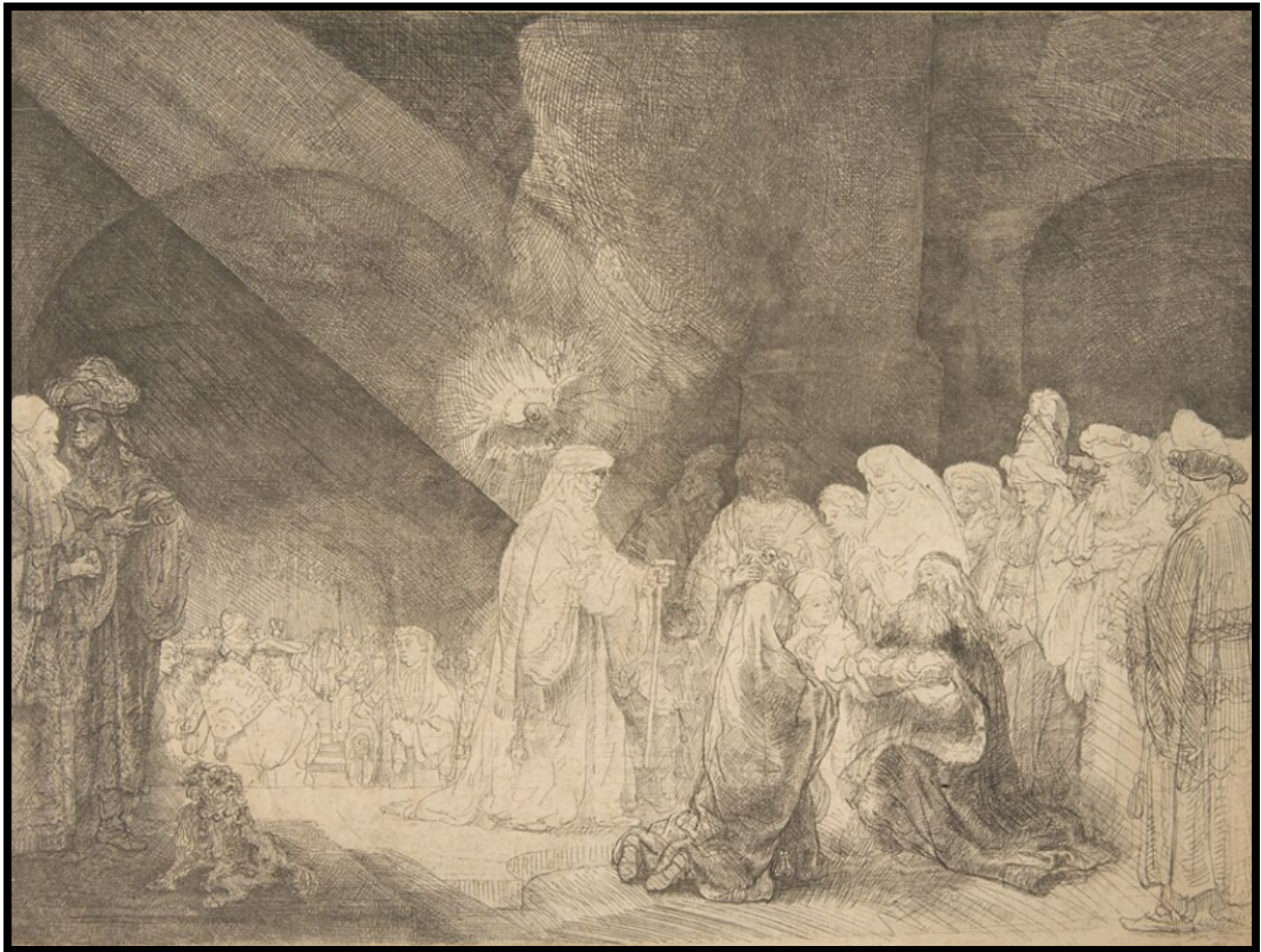
The Presentation in the Temple by Rembrandt van Rijn, 1634/1644, Metropolitan Museum of Modern Art, New York City, USA.

My eyes have seen your salvation, which you have prepared in the presence of all peoples, a light for revelation to the Gentiles and for glory to your people Israel. Luke 2.30–32