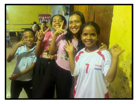
Some residents in the Dili refuge (YWAM).