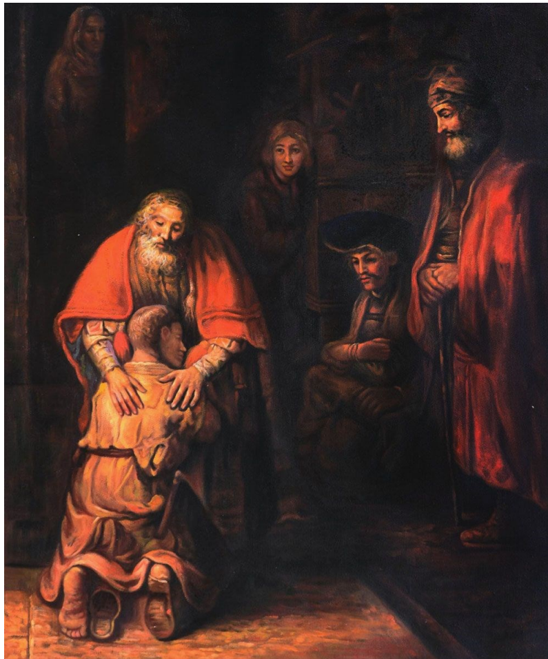
Rembrandt van Rijn, The Return of the Prodigal Son , 1661-1669, Hermitage Museum, Saint Petersburg, Russia.

While he was still far off, his father saw him and was filled with compassion; he ran and put his arms around him and kissed him. Luke 15.21